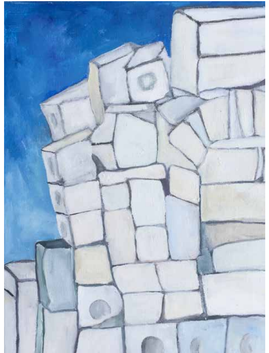
Junkscape , 2019, oil on canvas, 30 x 40cm