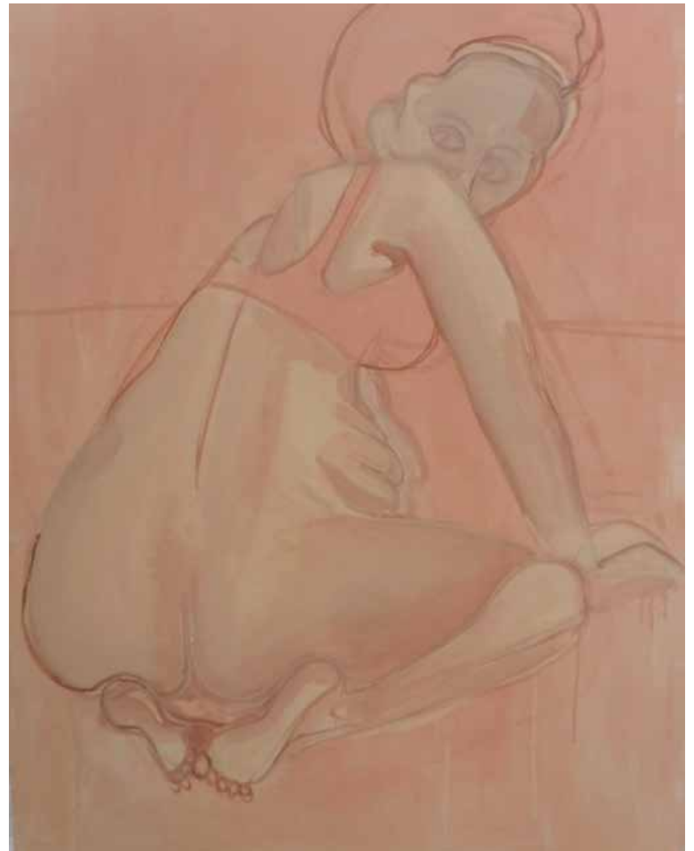
Looking back , 2019, oil on canvas, 91 x 61cm

Email: tabithapeake@hotmail.com Instagram: tabitharpeake