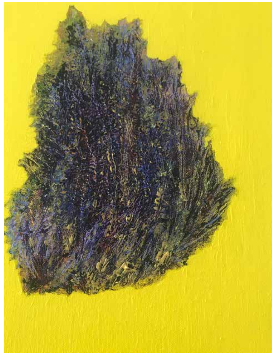
Drift (detail), 2018/19, oil on canvas, 89 x 120cm

Email: gilllucas@hotmail.com Instagram: gilllucas5