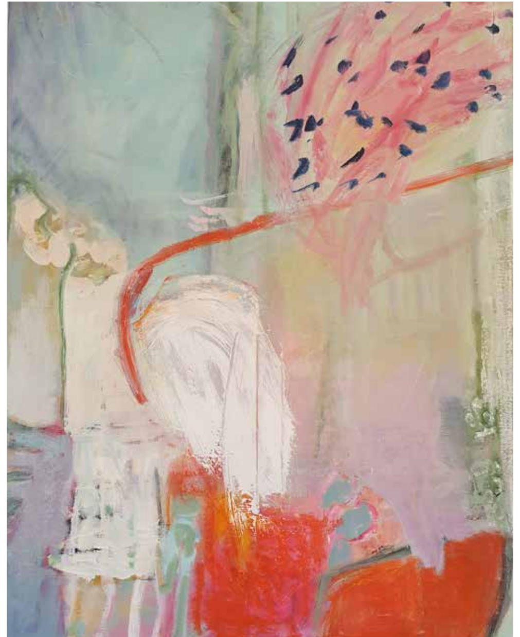
Look to the sky, 2019, acrylic on canvas 90 x 70cm