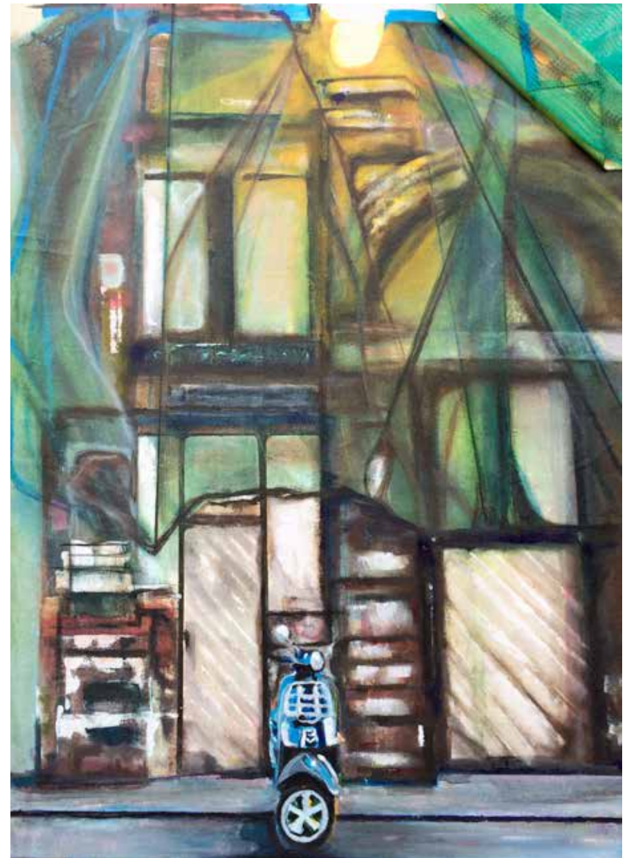
City dYss_Excavation I , 2019, acrylic and ink on canvas with debris net, 59.5 x 84cm