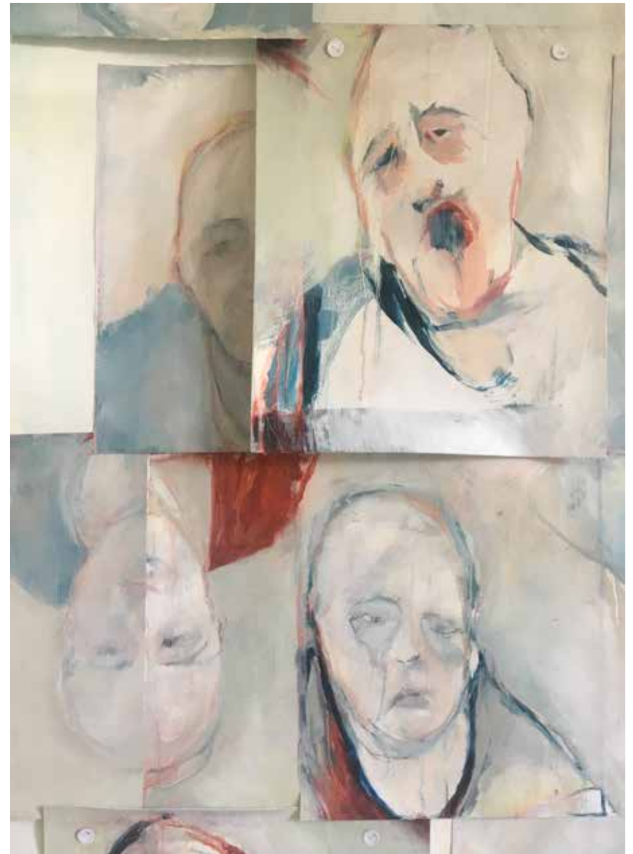
Delicate Remix (detail) , 2019, oil and collage on gesso-prepared paper, 96 x 170cm

Website: inghamart.simpl.com Instagram: carolineingham_paintings