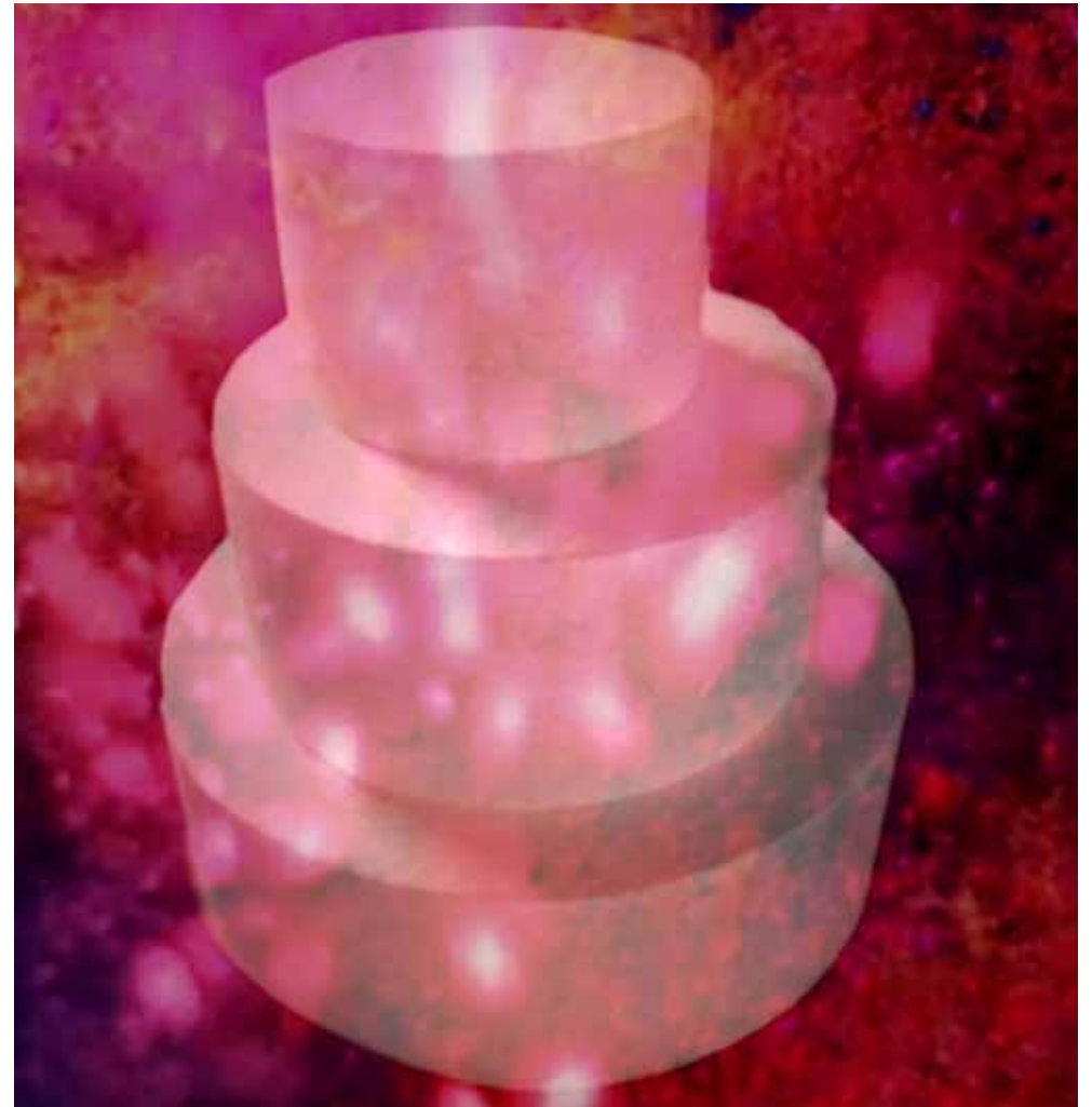
Falling pigment pink, 2019, video still

Email: louise@louiserichardsart.com Website: louiserichardsart.com Instagram: lou.richards