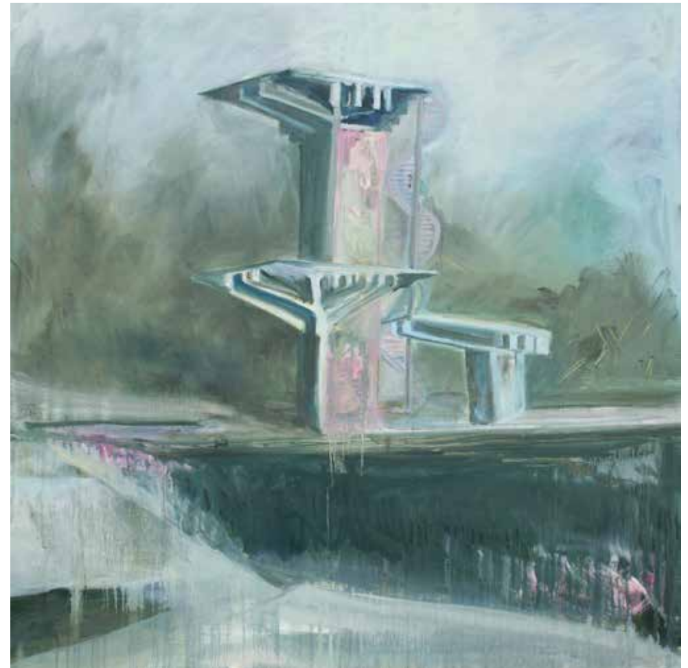
Jump Into The , 2019, oil on canvas, 100 x 100cm

nikicampbellartist.wordpress.com maidennames.wordpress.com