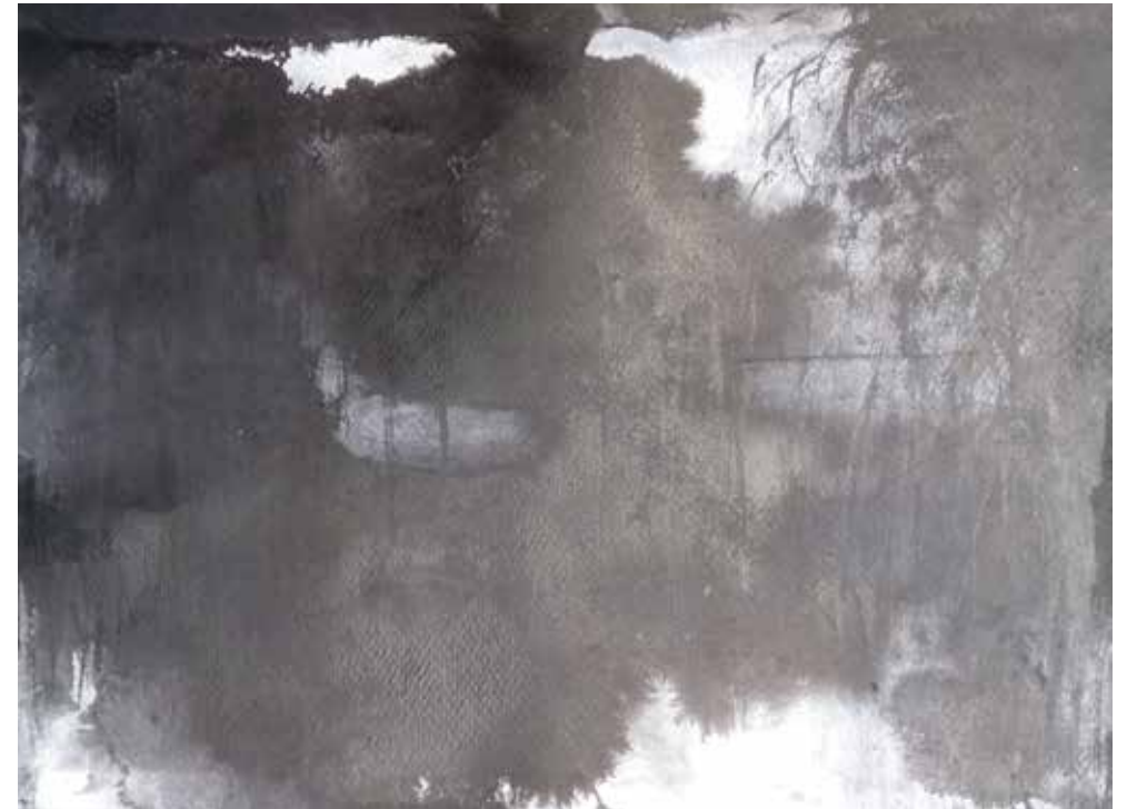
Night and day, 2019, black ink on paper, 30 x 42cm

Website: painterpavli.artweb.com Instagram: @helen_pavli