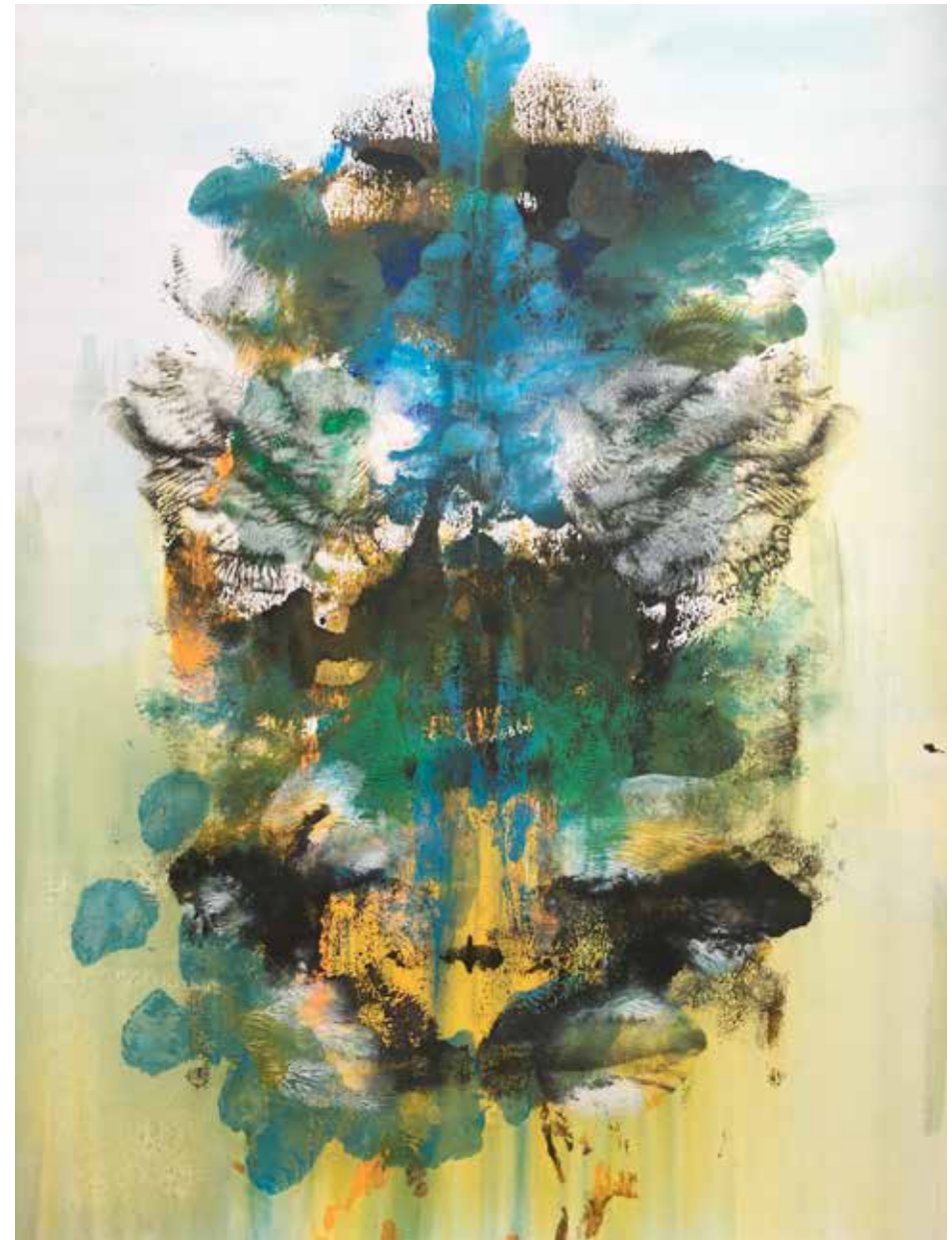
Ashlye , 2019, watercolour, ink and acrylic on paper, 42 x 59cm

Website: terryjbarber.com Instagram: terrybarberartist Twitter: @terriscrubble