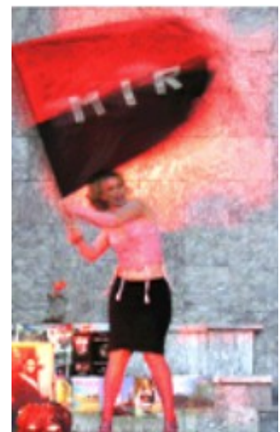
Collective Unconscious among Serbs (2011)