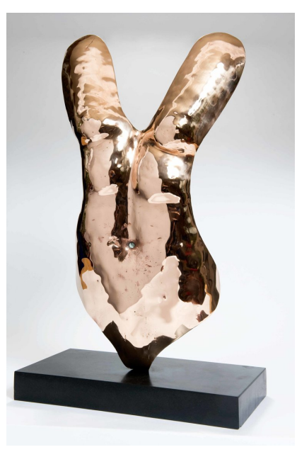
Female Form, 2011, bronze, 55 x 8cm