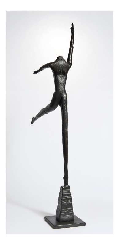
The Dancer, 2007, mild steel, 92 x 44 cm

Gallery Contact: +44(0)7815 319073 info@espaciogallery.com www.espaciogallery.com