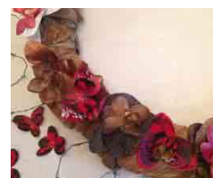
Lindsay Terhorst North

Reflecting on the strength and resilience of girls held in POW camps in WWII.